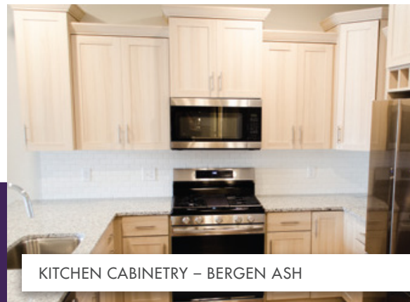
KITCHEN CABINETRY – BERGEN ASH