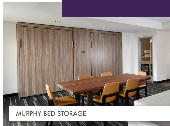
MURPHY BED STORAGE

DISTRIBUTOR | Distribution Services Inc.(OH)